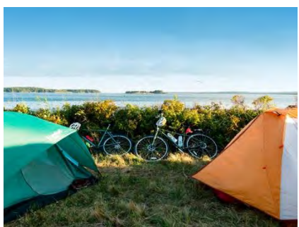
Photo: Bold Coast Scenic Bikeway https://discoverboldcoast.com/biking/ bold-coast-scenic-bikeway/

Downtown beautification projects grace new sidewalks with ample wheelchair access.